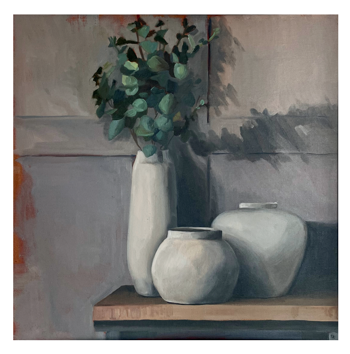
AFTERNOON SHADOW OIL ON LINEN 50 X 50 CM