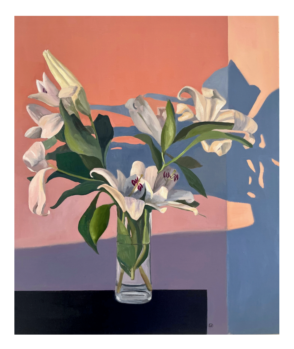
EVERYWHERE, GOLDEN LIGHT OIL ON LINEN 61 X 51 CM