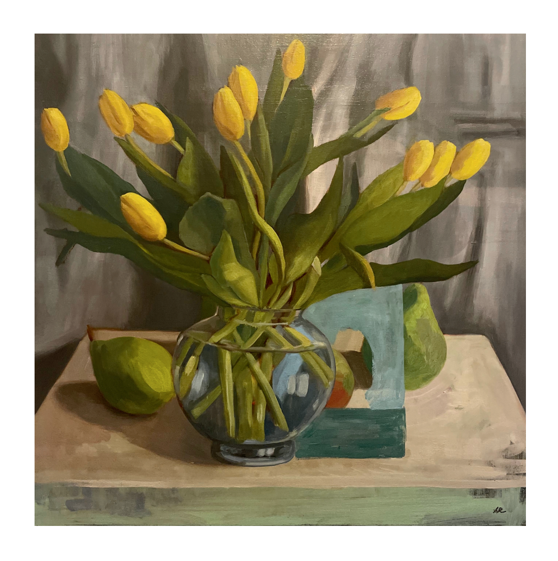
TULIPS OIL ON LINEN 63.5 X 63.5 CM