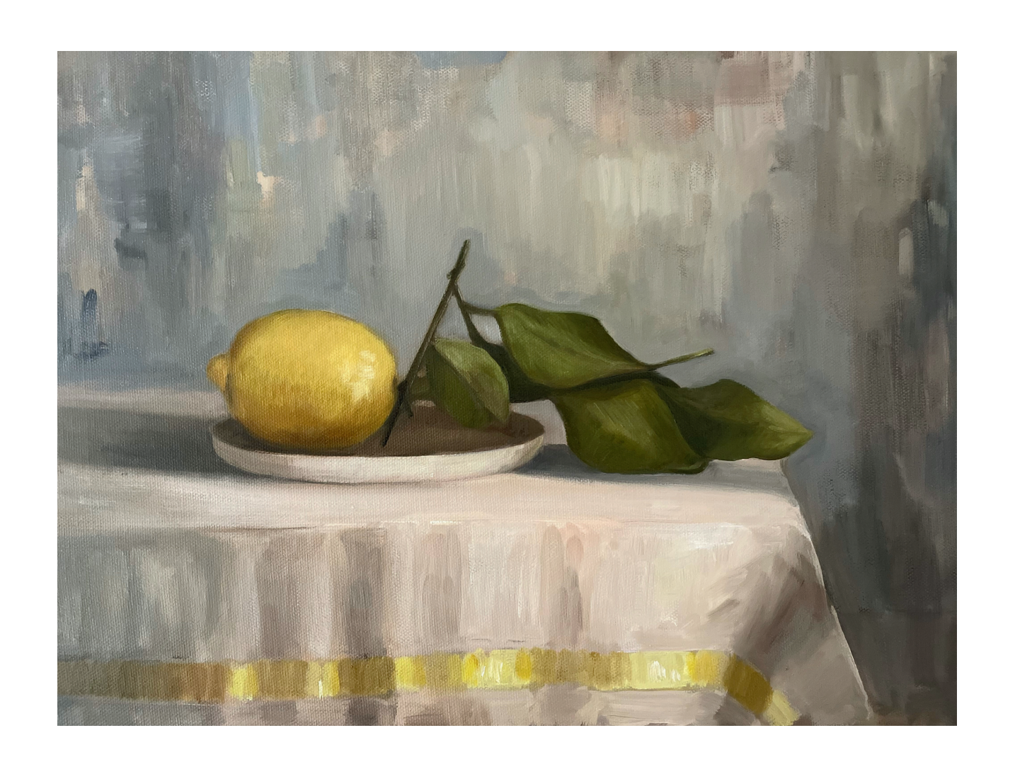
LEMON & STALK OIL ON LINEN 30 X 40 CM