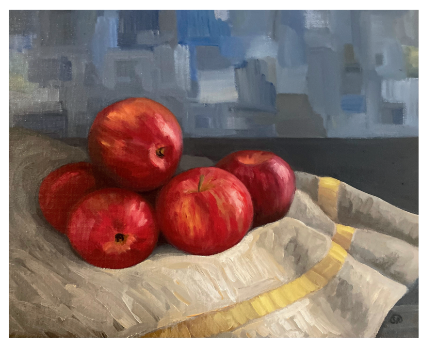
RED BOUNTY OIL ON LINEN 24 × 30 cm