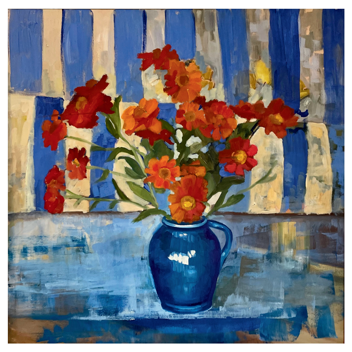
JOY OIL ON LINEN 61 X 61 CM