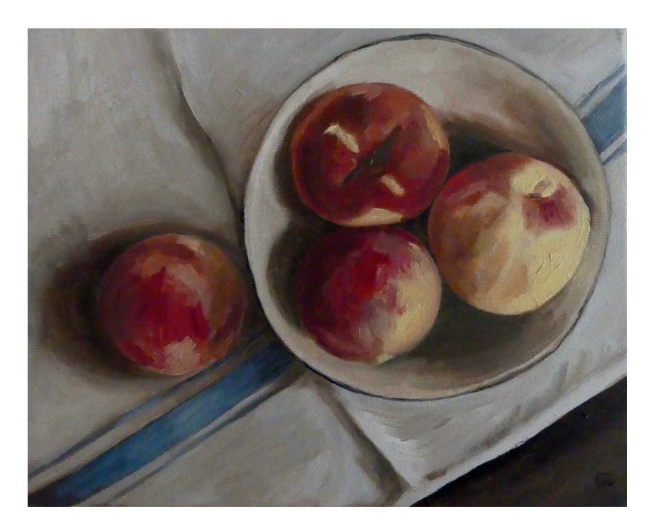
PEACHES ON A TABLECLOTH OIL ON LINEN 20 × 25 cm