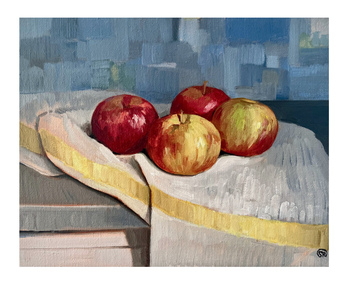
APPLES, MARK II OIL ON LINEN 24 X 30 CM