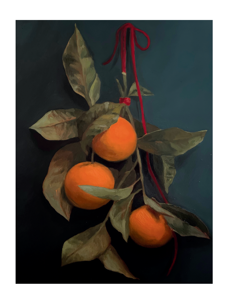
SICILIAN ORANGES OIL ON WOOD PANEL 46 X 36 CM